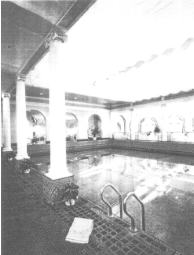
Figure 7. The indoor pool at the Greenbrier opened in 1912.

The other major structure completed about the same time (1913) was The Greenbrier Hotel. It was six stories high, and had 250 rooms, with a ballroom, billiard room, card room, dining room and shops. It was fireproof stone and concrete, unlike its wooden predecessor Old White, and built in Georgian architectural style. It forms the central section of today's building. The Old White was torn down in 1922 when it couldn't pass the West Virginia fire inspection code. The Greenbrier Hotel was rebuilt and doubled in size to 580 rooms in 1930. An airport was also opened around this time. Tennis and golf became two major attractions for the resort, with Sam Snead as one of the young golf pros.