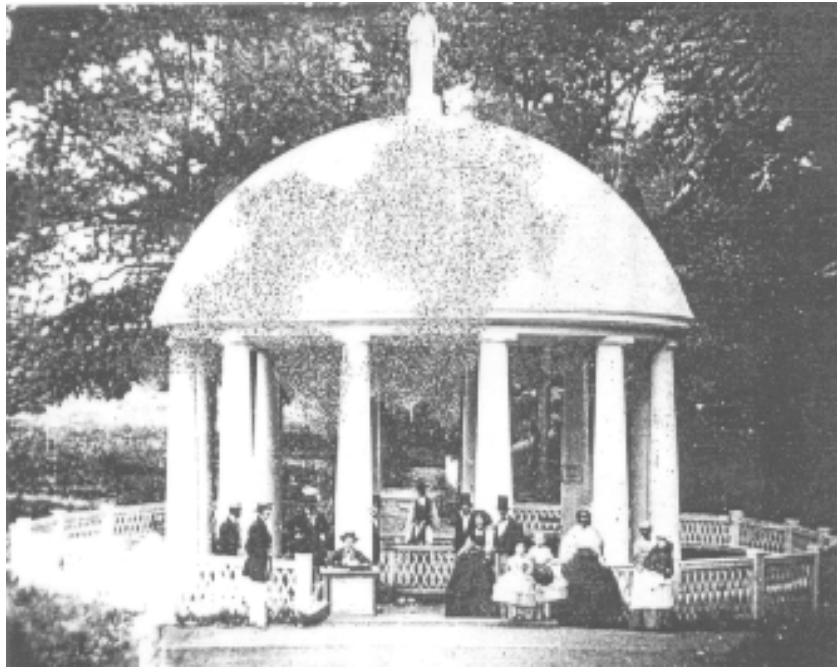
Figure 1. The earliest known photograph of the Spring House, taken in the 1850s, showing the original statue atop the dome.

In the 1830s and 40s, the resort grew in guest capacity from about 200 to over 700, and the number of buildings was three times as many. The living quarters consisted of the older log cabins, ivy-covered white houses and magnificent private residences with tall white columns called the Colonnades. These rows of houses were built around a square facing the tavern and spring. The resort area grew from the original 385 ha (950 acres) to nearly 2,800 ha (7,000 acres), its size today. In 1857, a new hotel was begun, that became known throughout the nation as the Old White Hotel. It was large by the standards at that time, over 120 m (400 ft) across at the front with 228 guest rooms on the two upper floors, and a dining room, parlors, several reception rooms and a ballroom on the first. The dining room was the largest in the U.S., seating 1200 guest comfortably. By this time, the resort was handling crowds up to 1600 people.