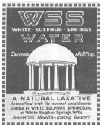
Figure 3. 1920s literature promoting the mineral waters.