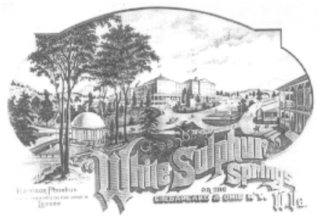
Figure 5. An 1883 poster showing the resort's location on the C&O Railway.

made accessible by the railroad to wealthy patrons, but to more middle-class travelers as well (Figure 5). More were traveling; but, a trend that developed throughout the U.S. brought about by this ease of travel, their stays were for shorter periods.