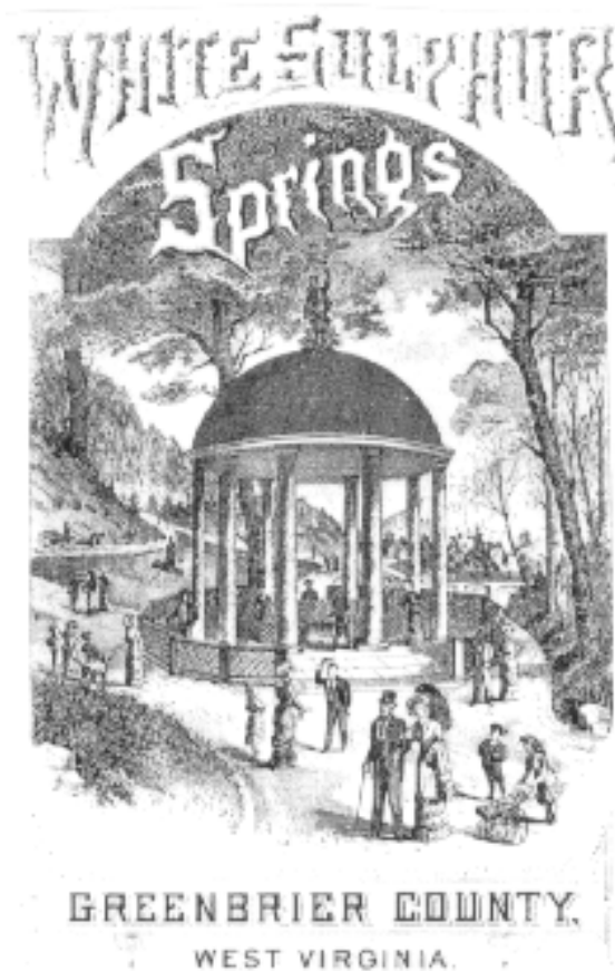
Figure 4. Brochure cover after the Civil War showing the resort's location in the new state of West Virginia.

Social activity at the resort quickly returned after the "War Between the States" (Figure 4); however, its financial situation was not the best. Much needed repairs to the property had to be delayed until debts were settled. One bright event was the arrival of the first train in 1869, providing passenger service on the Chesapeake and Ohio Railway. This guaranteed the resort's survival, especially since it was the only resort among the Springs of Virginia that could boast of service directly to its main gate. The railroad made the act of traveling pleasurable, as travelers from Washington, D.C., for example, reached the resort in 15 hours rather than the four or five days necessary in the past. Not only were the resorts