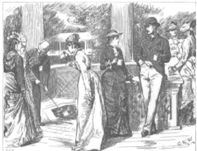
Figure 2. Visitors in the Spring House practicing one of the daily rituals of White Sulphur Springs.

sulphur water by using and drinking them in moderation. The most common error at the time was the belief among visitors that "they benefitted in proportion to the quantity which they drink" (Conte, 1989). As a general rule, he recommended four to eight glasses per day, working up to ten or twelve at most after two weeks, and believed that two weeks was the minimum period of time for the water to be effective, and its benefits began to appear only after three to six weeks (Figure 2).